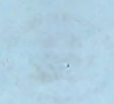
EXHIBIT BY AGREEMENT